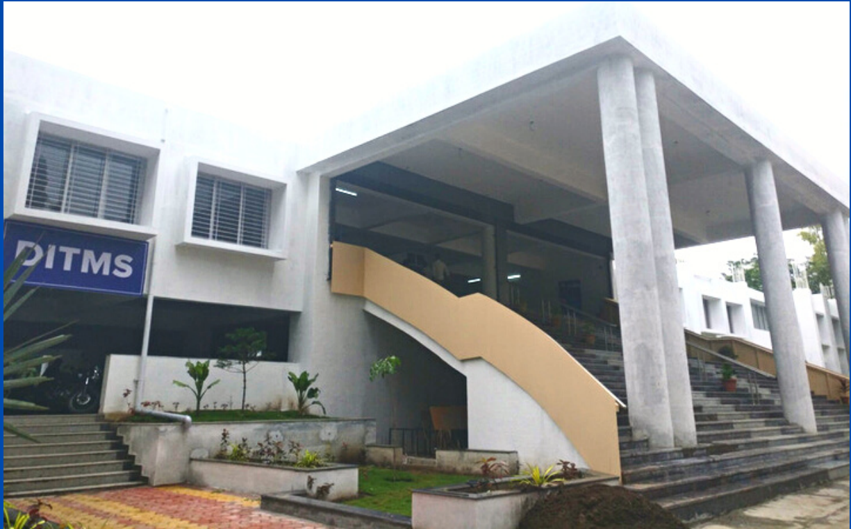
DITMS NEW BUILDING