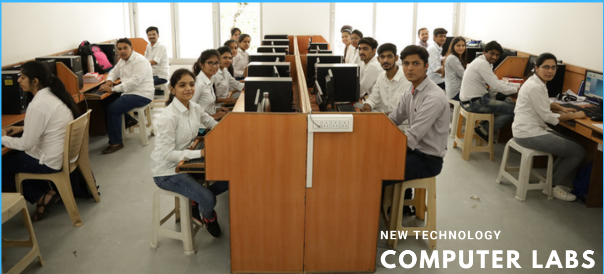
NEW TECHNOLOGY COMPUTER LABS