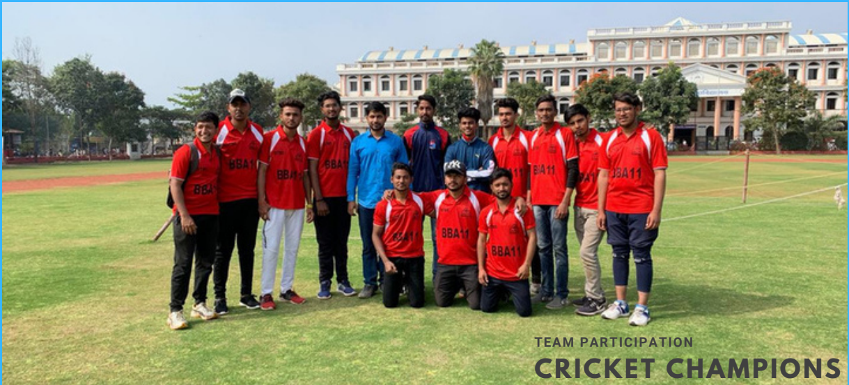
TEAM PARTICIPATION CRICKET CHAMPIONS