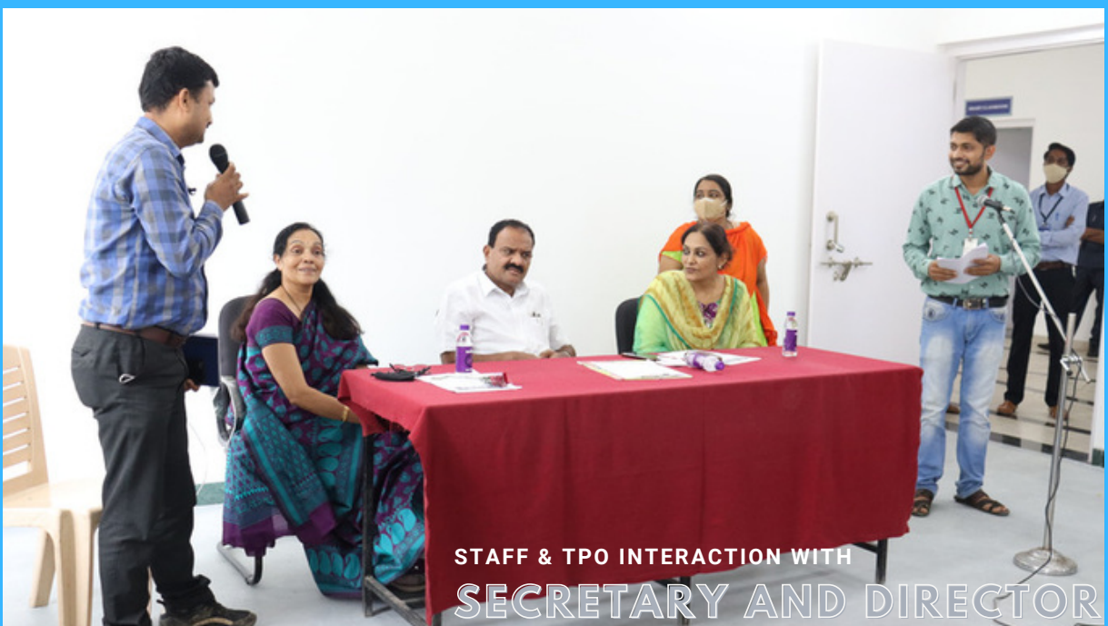
STAFF & TPO INTERACTION WITH SECRETARY AND DIRECTOR