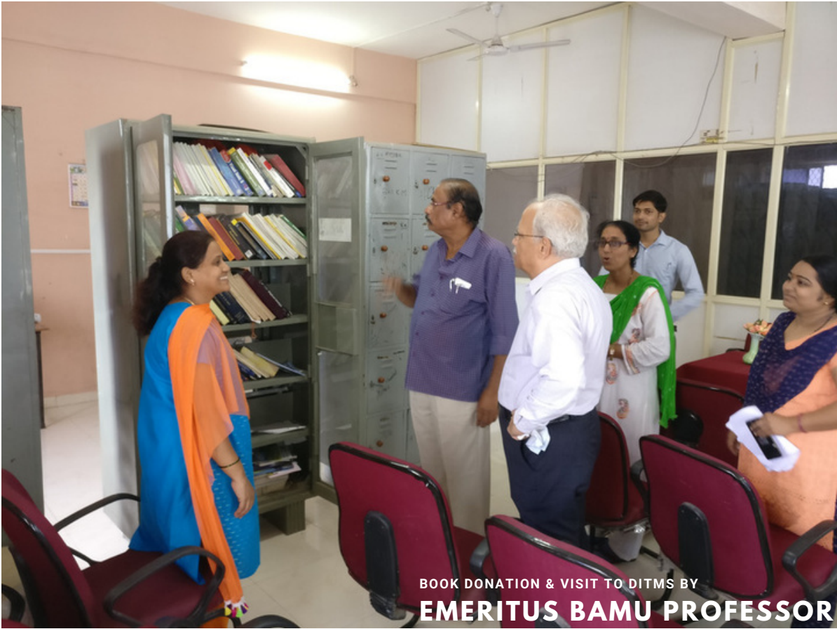
BOOK DONATION & VISIT TO DITMS BY EMERITUS BAMU PROFESSOR